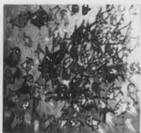
Friendship No.1, Acrylic on Canvas, 100X120 cm.

These artworks series were created under the Abstract Expressionism concept. These artworks were painted by applied the paint rapidly on the canvases. The bright colors were used to represent the fighting and struggling in the real world. Fishes and Hands were used to represent the human that living in the globalization society.