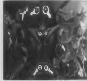
Friendship No.4, Acrylic on Canvas, 100X120 cm.