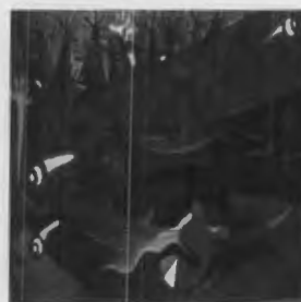
Friendship No.2, Acrylic on Canvas, 100X120 cm.