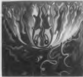
Friendship No.5, Acrylic on Canvas, 100X120 cm.