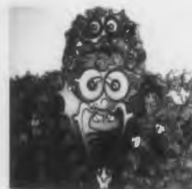
Friendship No.10, Acrylic on Canvas, 100X120 cm.