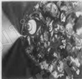
Friendship No.7, Acrylic on Canvas, 100X120 cm.