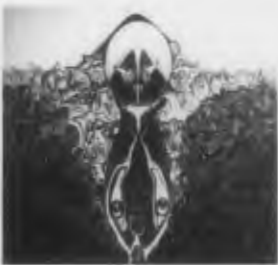
Friendship No.9, Acrylic on Canvas, 100X120 cm.