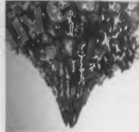
Friendship No.8, Acrylic on Canvas, 100X120 cm.