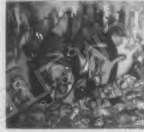
Friendship No.6, Acrylic on Canvas, 100X120 cm.