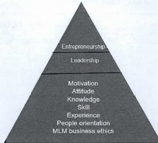
Figure 2. The Individual MLM Distributor Competency Diagram