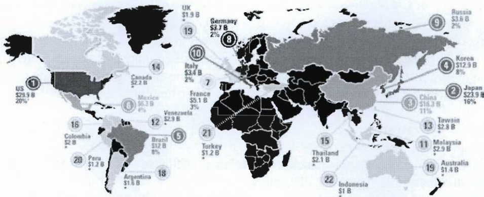
Figure 1. 2011 WFDSA ranking of Direct Selling’s Billion Dollar Markets and their percent of the global market (WFDSA, 2012)

Note: * represents less than 2% of the global market