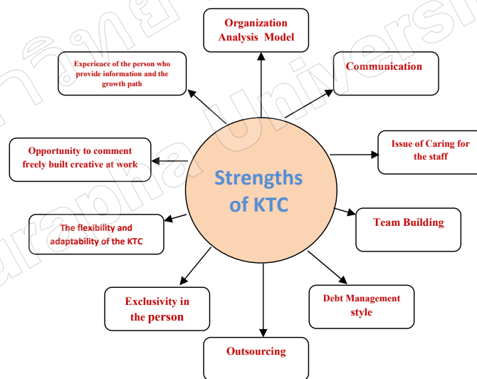
Figure 2. The Exclusivity in the strengths of KTC

In summary, changes of the ‘Organization Development’ in KTC was the main contribution of KTC’s first leader who used the ‘differentiate strategies’ approach to change the working style from ‘traditional finance and banking working style’ to be a ‘creative working style’ with IT and new technologies support that was appropriate to the new Gen Y working style, as they love to work in a flexible environment, fast learning, love to work in a challenging job and have a high ability to accept change. These changes made KTC into a ‘unique working culture’ and gained respect from outsiders. Moreover, the second leader, who followed the first leader’s strategies, helped to focus on all details with accuracy and correct information in business, so that the company could grow the credit card business in a highly competitive environment.