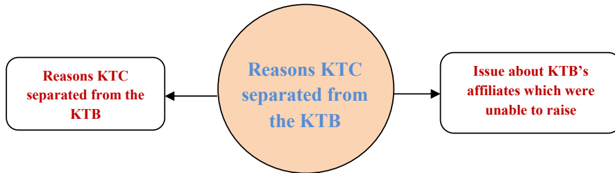
Figure 4. Reasons of KTC had separation from the KTB