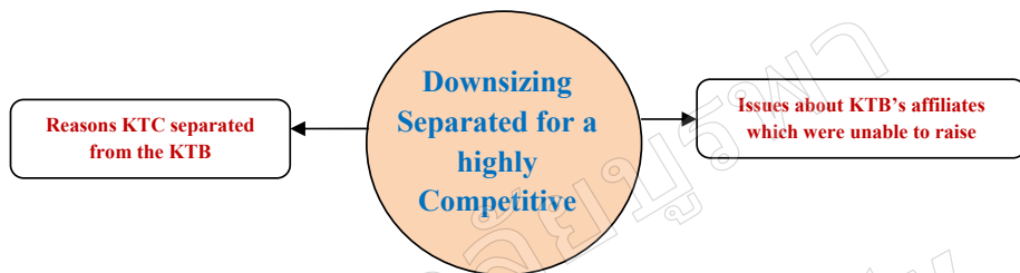
Figure 3. Downsizing separated for a highly competitive business

business. In the early stages of the adaptation process, KTC used an HR and Management Consulting Firm to set up a system to provide care for its people and also had a systematic evaluation for manpower planning in the future. In addition, KTC hired an outsourcing consultant that ultimately led to a systems consulting firm for Human Resources. KTC, the organization, had a distinctive, clear vision and mission. Employees had the freedom to express their opinions freely and were free to sit anywhere. There was no atmosphere of pressure. The organization had a supportive environment for employees to work in independently.